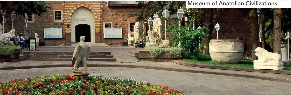
Museum of Anatolian Civilizations